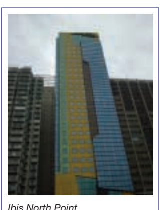
Ibis North Point

The properties of Allied Kajima group, which is 50% indirectly owned by Allied Properties, including Allied Kajima Building, Novotel Century Hong Kong hotel and the Westin Philippine Plaza Hotel, together contributed a 15.9% increase in profit compared to the previous year.