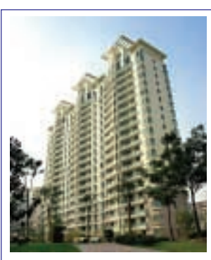
Wuxi Redhill Peninsula

yield thereby providing a stable recurrent income base, (b) disposing of inventories of properties and land in non-core cities and concentrating on the development of its very substantial land bank in the major cities of the PRC, and (c) continuing to streamline its management and cost structure.